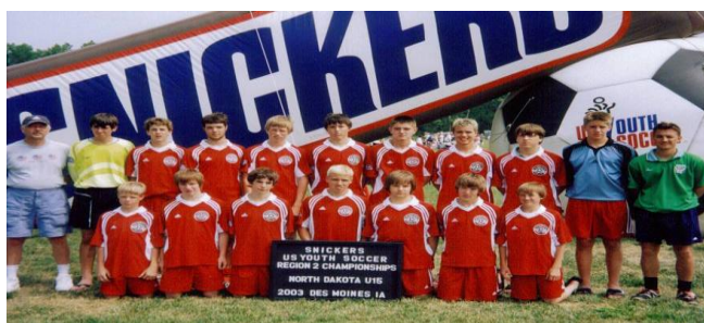
Red River Soccer Club North Dakota, Fargo USA State Cup Champions 1998-2003

The daily program consists of 6 hours of structured activities and aims to promote confidence and experience in a variety of different game situations. Players are coached in all aspects of technical and tactical game play and these skills are put into practice through competitive play. At the start of the week, players are grouped into training groups based on age and ability. They will be given a coach each to get a sense of how real teams work, and will have the same coaches all week to build up a rapport.